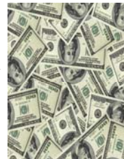
Plus Four $100 weekly prizes