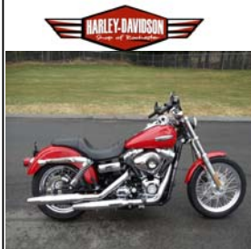
Harley Davidson 2010 FXDC, DYNA Glide Custom, Scarlet Red