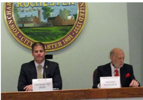
Mayor Candidate Forum

UPCOMING EVENTS December 2 Holiday Tree Lighting 5:30pm Rochester Follies at Rochester Opera House, 8:00pm December 4 Rochester Holiday Parade 3:00pm December 13 Rochester Main St. & Rochester Opera House Business After Hours 5:30-7:00pm