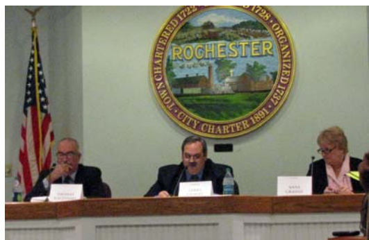
School Board Candidate Forum