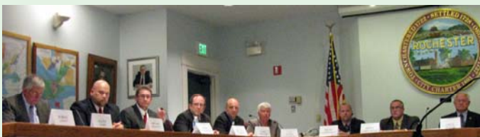
City Council Candidate Forum

Remember to vote on Election Day, November 8