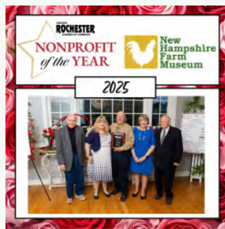
New Hampshire Farm Museum