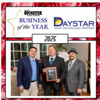
Daystar— Your Technology Partner