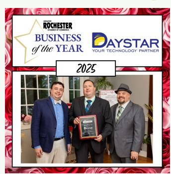
Daystar— Your Technology Partner

Click on each image to see each awards recipient's video