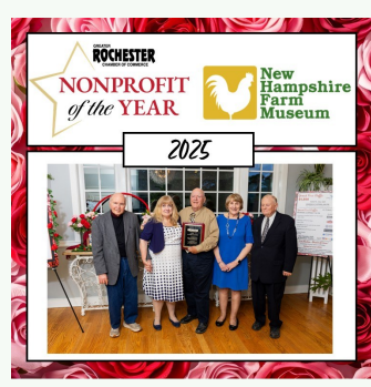
New Hampshire Farm Museum