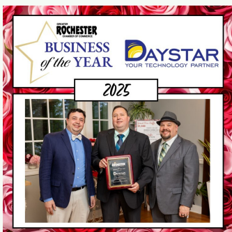
Daystar— Your Technology Partner