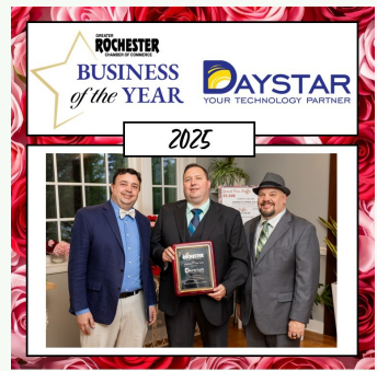
Daystar— Your Technology Partner