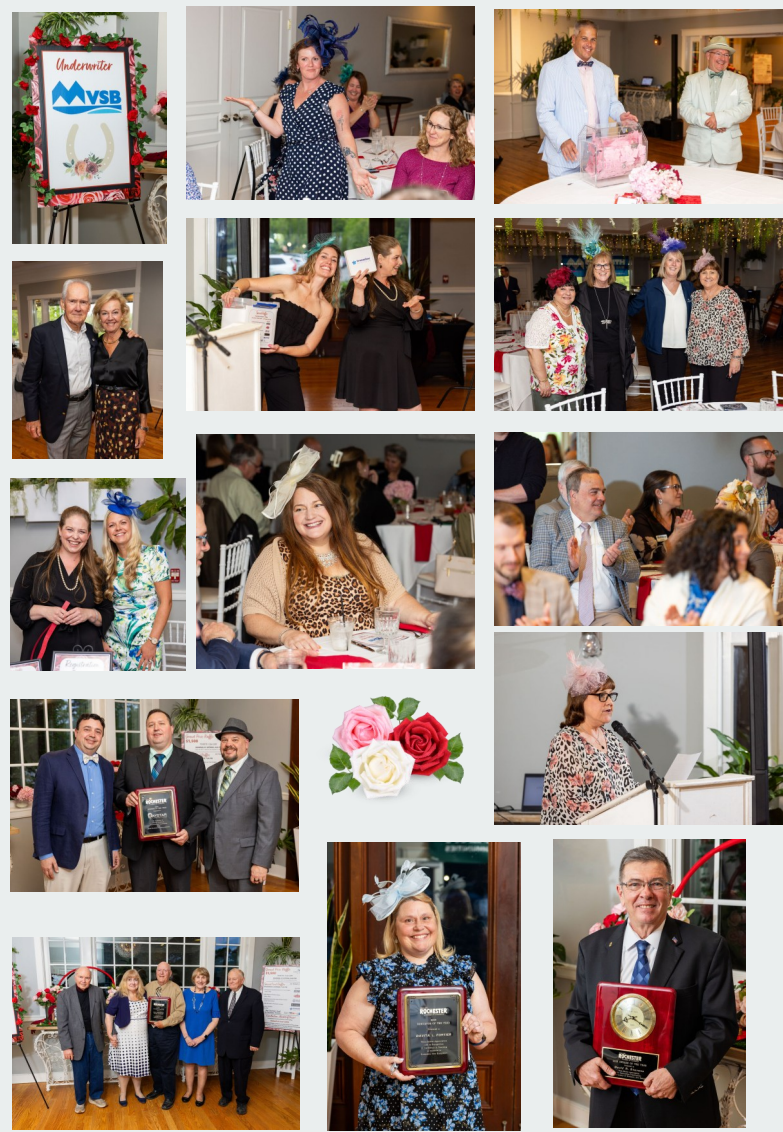
2025 Annual Awards Celebration May 21