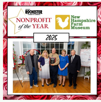
New Hampshire Farm Museum