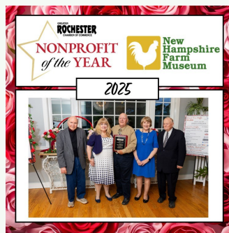
New Hampshire Farm Museum