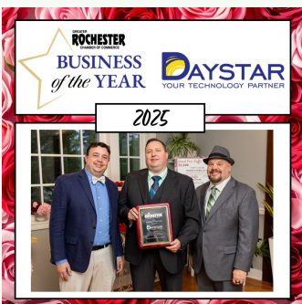
Daystar— Your Technology Partner