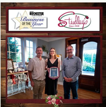
Studley Flower Gardens, Inc.

Click on each image to see each awards recipient's video