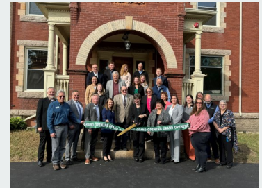
The Gafney Home Opening