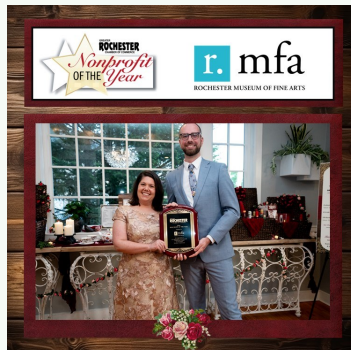
Rochester Museum of Fine Arts