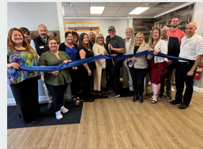
Busy Bee Cafe Opening